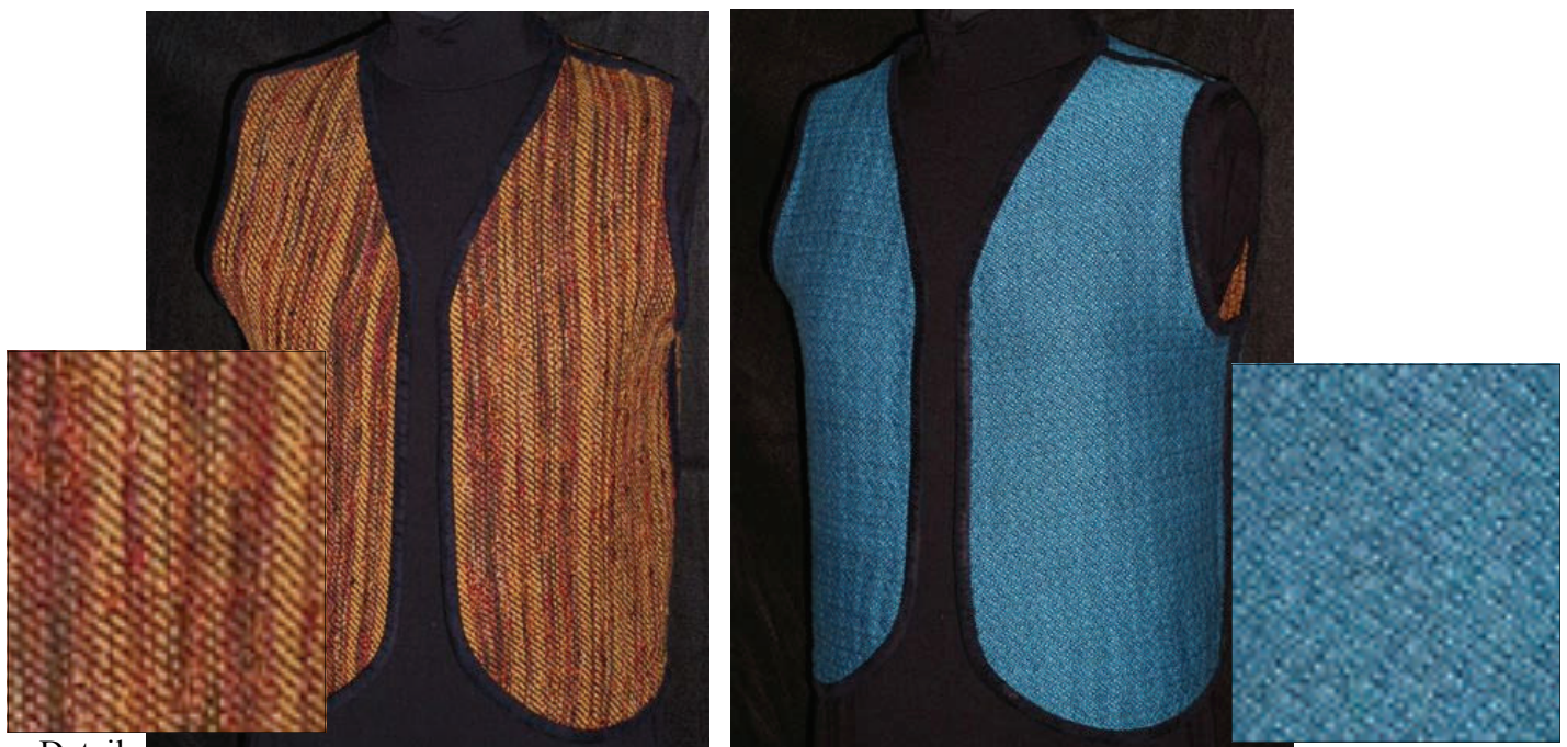
Detail, side I